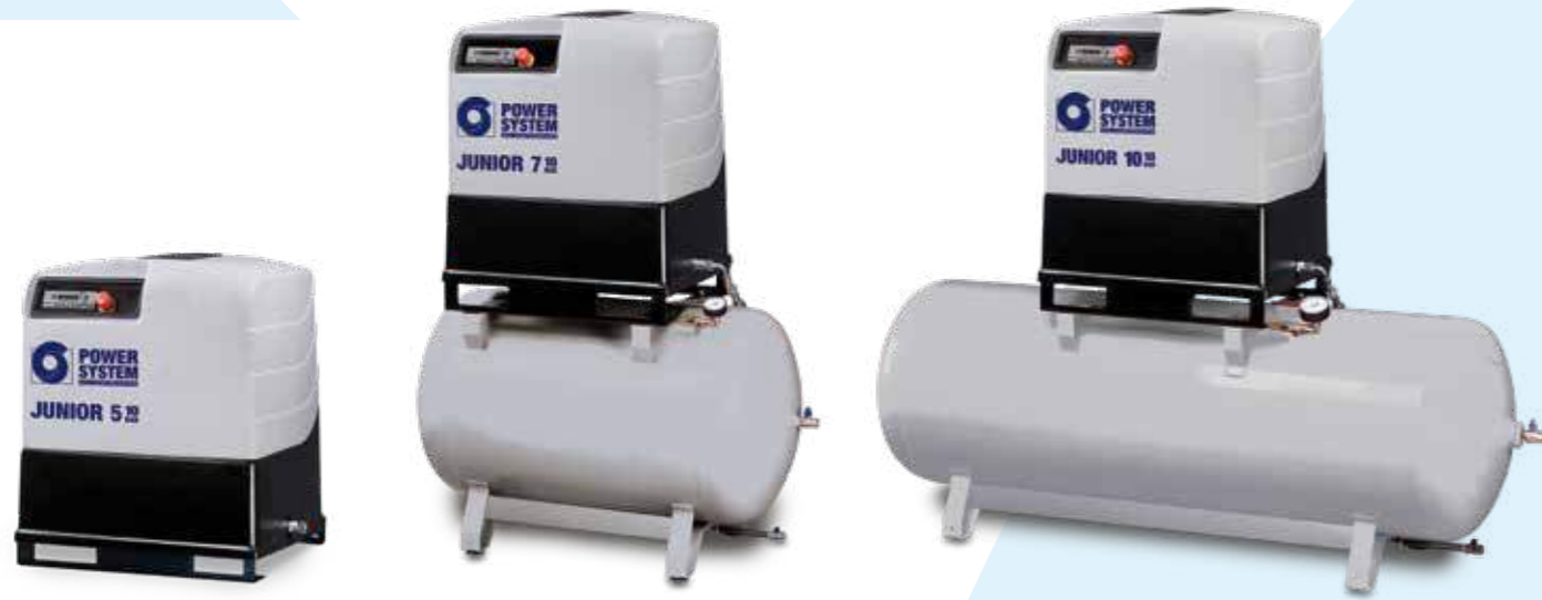
JUNIOR SD floor mounted